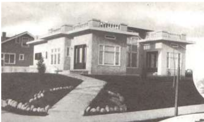
4103 SE Pine