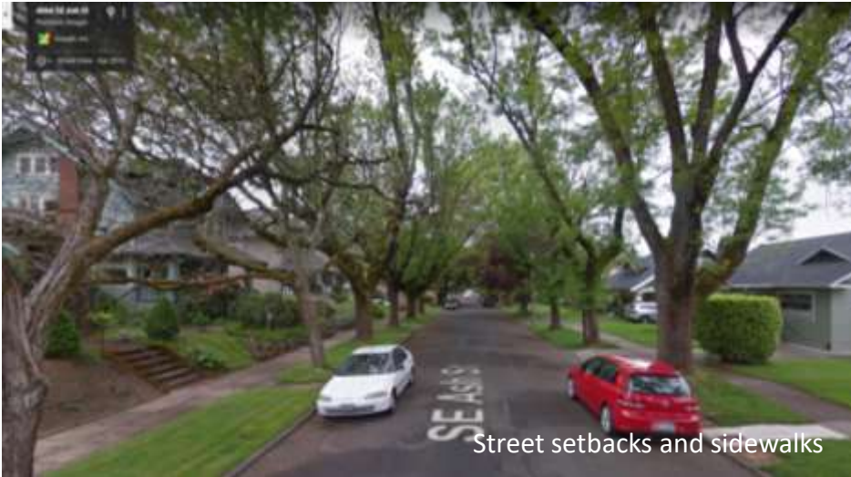
Street setbacks and sidewalks