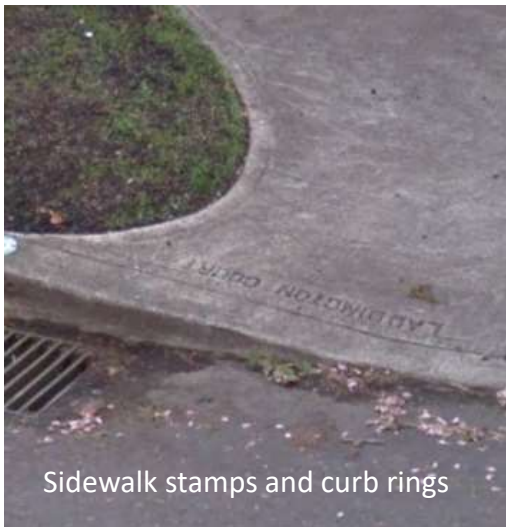
Sidewalk stamps and curb rings