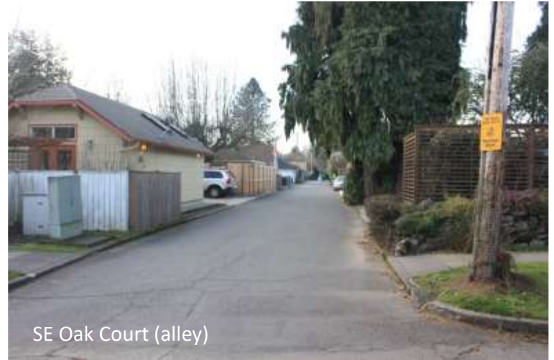
SE Oak Court (alley)