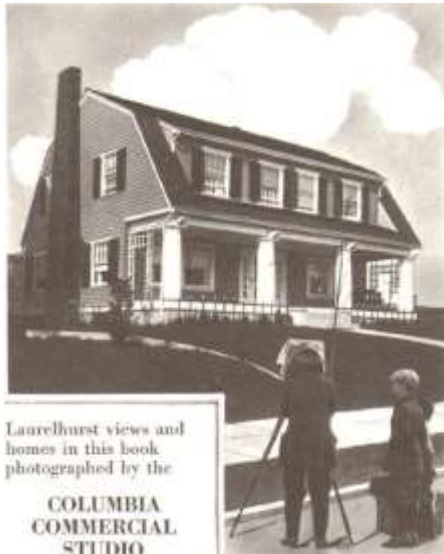
4347 NE Flanders