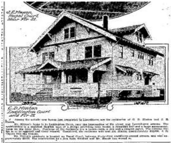
4225 NE Laddington Ct.